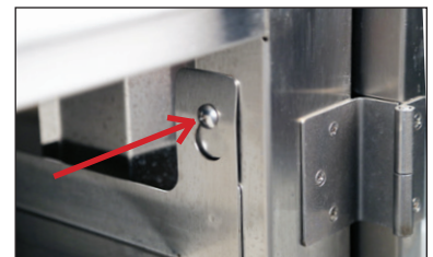
Friction cam ledge panel mounts eliminate vibration noise.