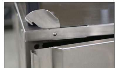
Pivot door travel latch holds door firmly against door frame pads.